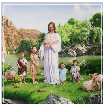
"The Light of Life"

August 6-8 at the Shrine of St. Therese, 300 Goodnight Ave., Pueblo, CO